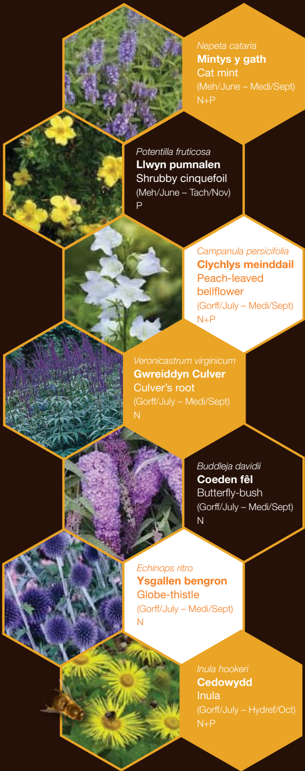
Nepeta cataria Mintys y gath Cat mint (Meh/June – Medi/Sept) N+P